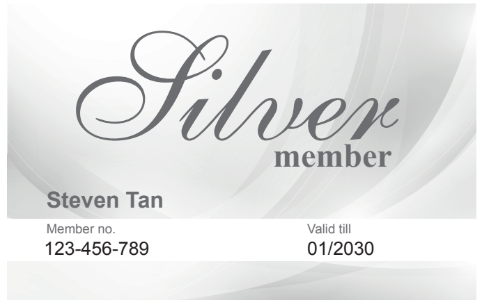
Page 2: Sample Artwork (VDP color depend on order color)