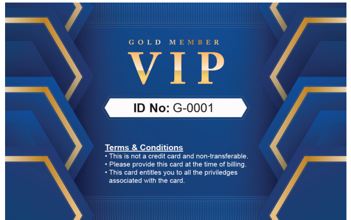
Page 2: Sample Artwork (VDP color depend on order color)