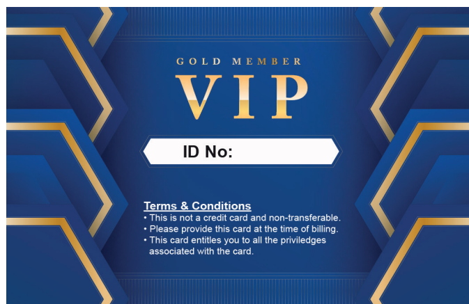
Page 1: CMYK Printing