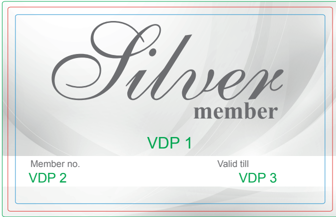
Page 1: Printing Artwork + VDP Identity & Location

VDP1 (Center) + VDP2 (Left) + VDP3 (Center)