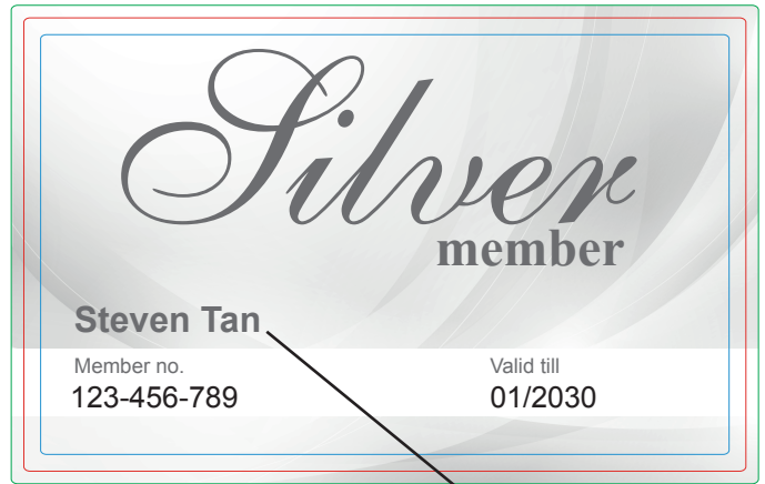
Page 2: Sample Artwork

Put the longest VDP number & text in the space and within safe zone to make sure the artwork outcome can printed out.