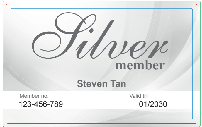
Page 2: Sample Artwork

Put the longest VDP number & text in the space and within safe zone to make sure the artwork outcome can printed out.