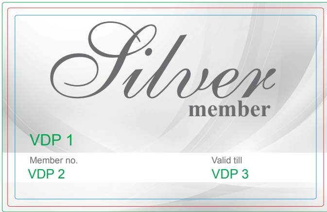
Page 1: Printing Artwork + VDP Identity & Location