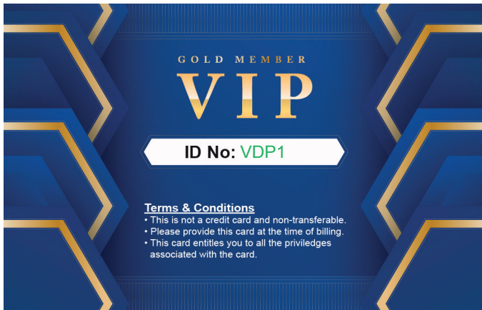
Page 1: Printing Artwork + VDP Identity & Location (VDP color have to in Green color)