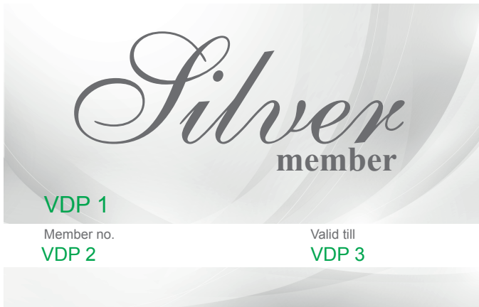
Page 1: Printing Artwork + VDP Identity & Location (VDP color have to in Green color)