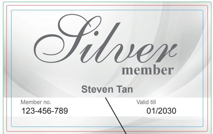
Page 2: Sample Artwork

Put the longest VDP number & text in the space and within safe zone to make sure the artwork outcome can printed out.