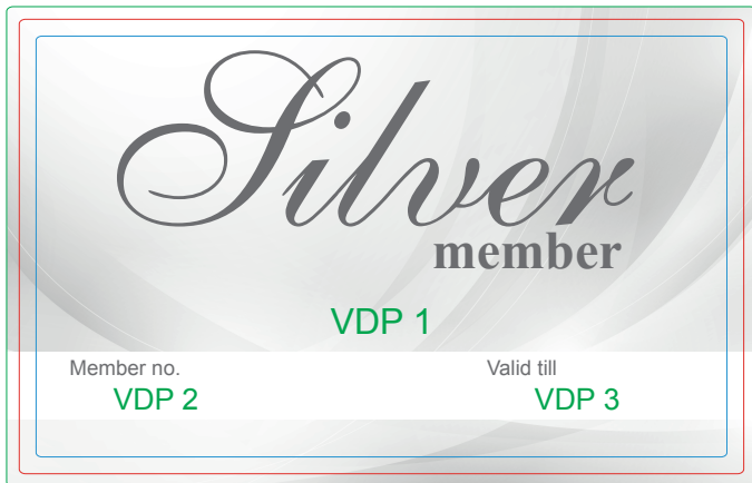
Page 1: Printing Artwork + VDP Identity & Location

VDP1 (Center) + VDP2 (Center) + VDP3 (Center)